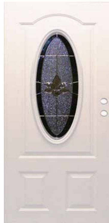
Optional 3/4 Oval Window

Manufacturing Division Elixir Door & Metals Company - Division 24 1215 Pope Drive, Douglas GA 31533 Tel: (912) 493-2200 • Fax: (912) 384-0047 www.elixirdoorandmetalscompany.com